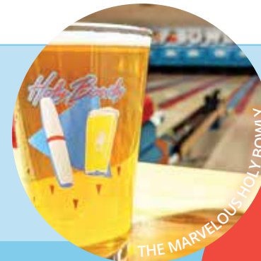
THE MARVELOUS HOLY BOWLY

If the Great Outdoors is calling your name, check out: