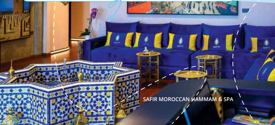
SAFIR MOROCCAN HAMMAM & SPA