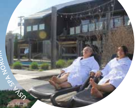
USVA SPA NORDIK