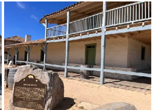
Stanton Center, left, and Custom House on Monterey's historic plaza