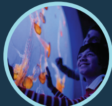
MONTEREY BAY AQUARIUM