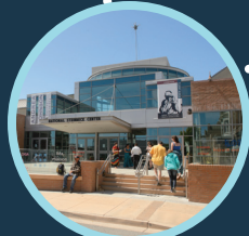
THE NATIONAL STEINBECK CENTER