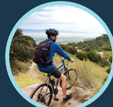
FORT ORD NATIONAL MONUMENT