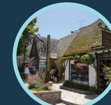
SHOPPING ON OCEAN AVENUE