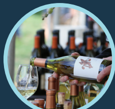
WINE TASTING ROOMS