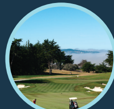
BAYONET & BLACK HORSE