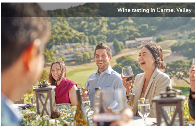
Wrath Wines, Soledad, River Road Wine Trail

Funded in cooperation with the Monterey County Board of Supervisors and the communities of Pebble Beach, Carmel-by-the-Sea, Marina, Monterey, Pacific Grove, Salinas, Sand City, Seaside, Moss Landing, Carmel Valley, Big Sur, and Salinas Valley.