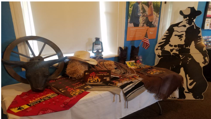
MCCVB partnered with the California Rodeo Salinas in creating the Experiential Display at the Monterey Visitors Center.