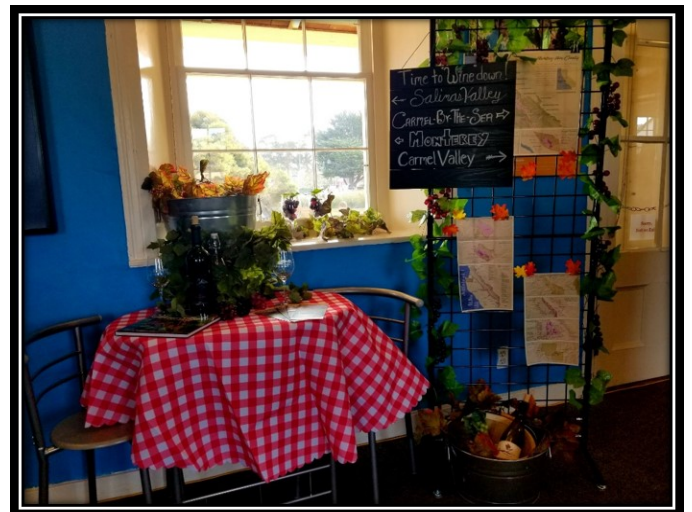
Thank you to MCVGA for providing props and materials to promote Monterey County Wine Country in the Visitors Center.

■ Attractions & Activities ■ Places to Stay ■ Food & Wine ■ Local Events ■ Sports & Recreation ■ Arts & Culture