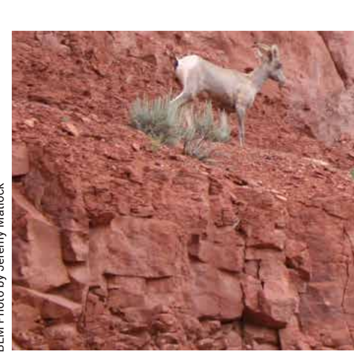
BLM Photo by Jeremy Matlock