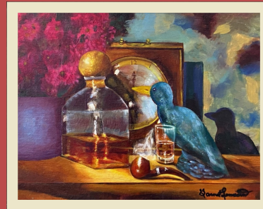
135 Pinecrest Drive "Pap's Homemade Cough Syrup" by artist Garnet Lemaster