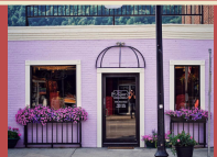
170 East Main Street