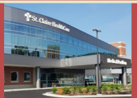
245 Flemingsburg Road