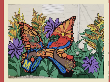
Behind 170 East Main Street "Koper's Boutique" by artist Jason Ratcliff