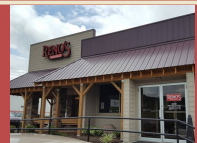
1695 Flemingsburg Road