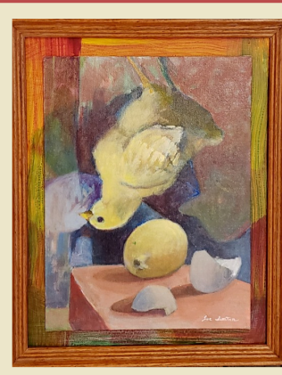
Rowan County Arts Center "Chicken Little" by artist Joe Sartor