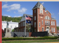
205 East Main Street