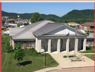
600 West Main Street