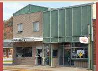
182 East Main Street