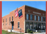
102 West First Street