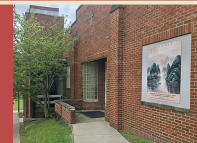
Corner of Hargis and Second Street