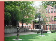
150 University Boulevard