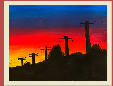
135 Hargis Avenue and West Second Street "Power Line Sunset" by artist Aleigha Caskey