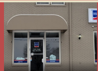
135 Pinecrest Drive