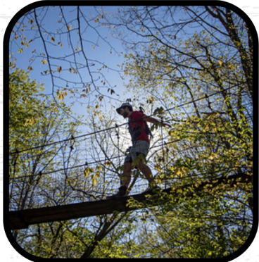
Hiking the Sheltowee Trace across the swinging bridge.