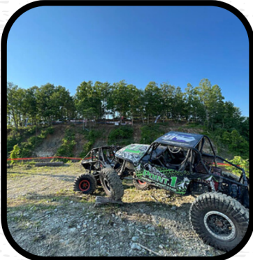
Taking an off-roading excursion and throwing some mud.