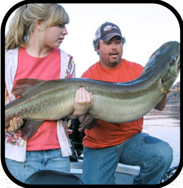
Catching the state record musky in Cave Run Lake.

No one forgets a unique experience and the best people to note those moments are you, our visitors! So here are just a few we have heard about. Be sure to TAG us @visitmoreheadky