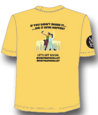
MUSTARD T-SHIRTS WORN BY STAFF AT VISITOR CENTERS THROUGHOUT NAPA VALLEY