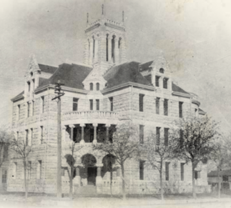
Comal County Courthouse, a 3-story Romanesque-style building constructed with limestone in 1898.