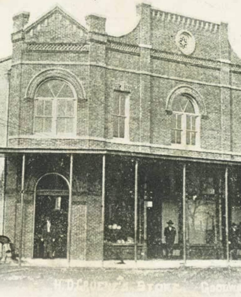
HD Gruene's General Store