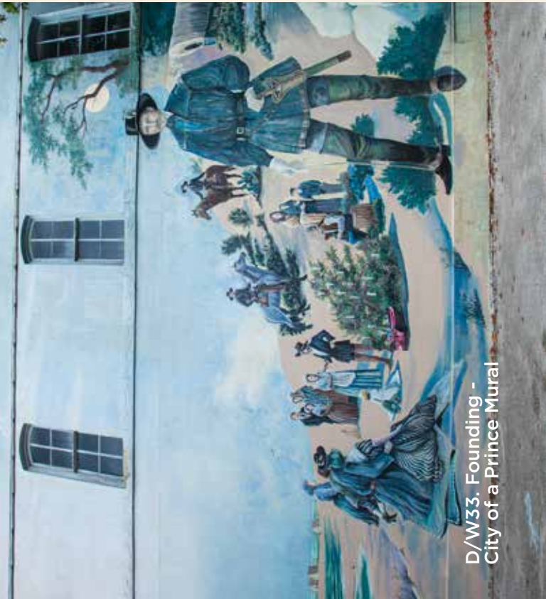
D/W33. Founding - City of a Prince Mural