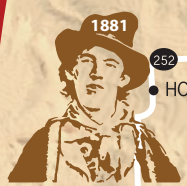
BILLY THE KID MUSEUM