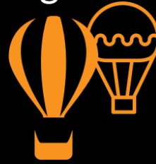
Trips, in Millions

Travel in New Mexico Grew at 2X the National Average in 2016