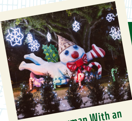
A Snowman With an Ice Cream Cone Cap

Planning to call New Orleans your home for the holidays? The city is bustling with holly jolly fun, from festivals and parades to uniquely New Orleans traditions. We've made our list of holiday favorites—and checked it twice. See if you can find all 10 before ringing in the New Year!