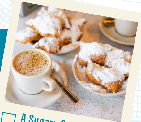
A Sugary Snow Drift Atop Beignets

You may not get real snow in New Orleans, but the powdered sugar piled high on top of fresh, piping hot beignets might just be better. Venture to the French Quarter for the world-famous Cafe Du Monde beignets, open 24 hours. You'll only wish your stockings were stuffed with more!