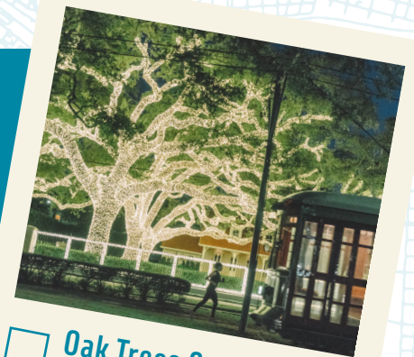
Oak Trees Strung With Lights

While you shouldn't miss the Celebration in the Oaks in New Orleans' City Park, that's not the only place to find majestic live Oaks glistening with lights and decorations. Take a stroll down St. Charles for a stunning showcase of lights. Hint: If you find the Academy of the Sacred Heart, then you know you're close to one of our faves (pictured right)!