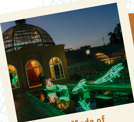
A Gator Made of Christmas Lights

Believe it or not, there's more than one way to catch a glimpse of a bedazzled alligator in NOLA! Your best bet? Head to Celebration in the Oaks in City Park for access to the Botanical Garden lit with half a million lights, plus Storyland rides and live entertainment. Or, get your ticket for Audubon Zoo Lights to enjoy animal-themed light displays combined with crafts and a holiday marketplace!