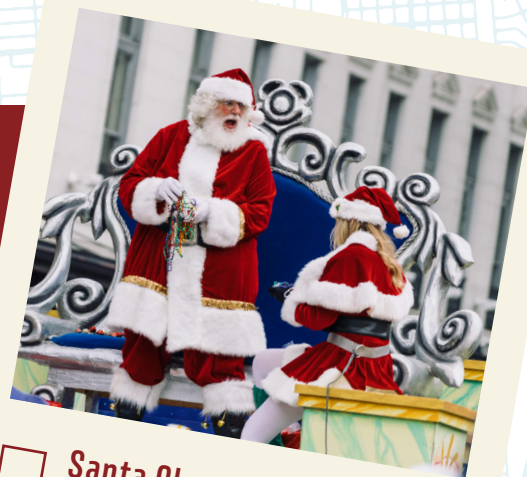
Santa Claus on a Float

Mardi Gras isn't the only holiday that gets a parade. Take the family to the Central Business District to kick off the holiday season with the Krewe of Jingle Christmastime parade or to New Orleans East for Jingle On The Boulevard. You'll see marching bands, festive dance troupes, and floats led by Santa and his helpers.