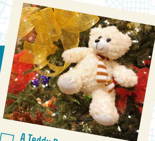
A Teddy Bear Drinking Tea

Bring the kids to a local restaurant, teahouse, or hotel upholding New Orleans' Teddy Bear Tea tradition. Sip on afternoon tea and indulge in sweet treats in the company of favorite holiday characters, then take home a special commemorative teddy bear.