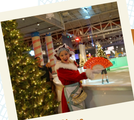
Mrs. Claus on Ice Skates

For a festival of all things merry and bright, you can't miss NOLA ChristmasFest. This annual celebration in the New Orleans Convention Center includes an ice-skating rink, ice slides, a carousel, and crafts. Wave hello to Mrs. Claus on your way to the world's tallest snowman!