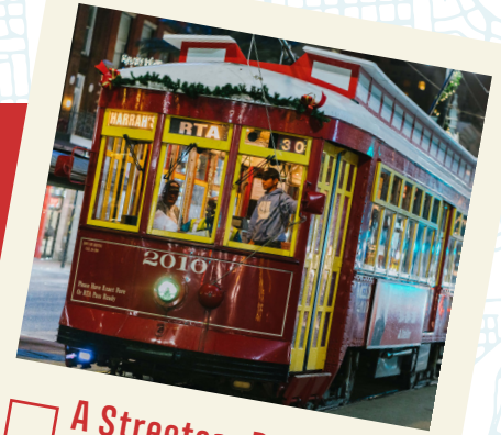
A Streetcar Dressed in Holiday Best

Riding the streetcars in New Orleans is a charming experience any time of year, but it feels extra special around the holidays. These historic cars get outfitted with greenery and red bows. Hop on the green St. Charles line to see even more spectacular decorations as locals showcase their holiday spirit.