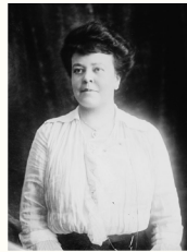
Left: Alva Vanderbilt Belmont. Below: A Votes for Women rally at Marble House.