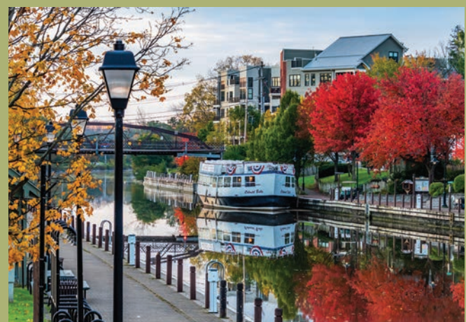
Fairport, Karen Millsbaugh

Submit up to three photos of your favorite places, views, and people enjoying the canals for a chance to win a spot in the special 2025 bicentennial edition of the Erie Canalway calendar. Images must be horizontal format. Enter today! www.eriecanalway.org/get-involved/photo-contest