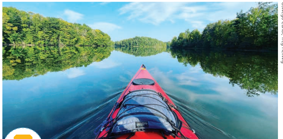
Oswego Canal, Treg Helliwig