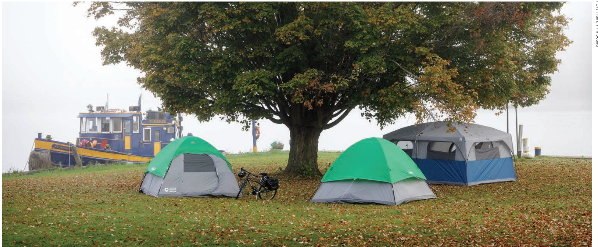
Fort Plain, Phil Scalia

A re you looking to camp along the New York State Canal System? You'll find good options available, but it's important to plan ahead to find overnight stays that fit the distance you want to travel each day. In addition to spots to pitch a tent, there are also hotels, bed and breakfasts, and Airbnbs that are easily accessible from the canal and trail.