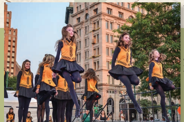
Syracuse, Flashback Photography

The lands and waterways along the canals today span the ancestral homelands of many First Nations—The Nations of the Haudenosaunee Confederacy, and the Mohican Nation. The Haudenosaunee Confederacy established a blueprint for democracy, which the Founding Fathers later drew upon when framing the U.S. Constitution. European-American settlement, canal construction and subsequent development were devastating to Native peoples. Indigenous nations remain present here today, contributing to our understanding of sustainable land and water stewardship and striving to carry on their rich heritage.