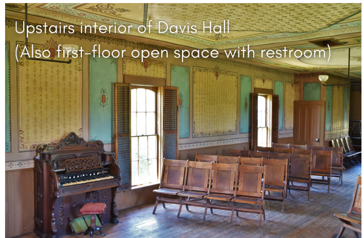
Upstairs interior of Davis Hall (Also first-floor open space with restroom)