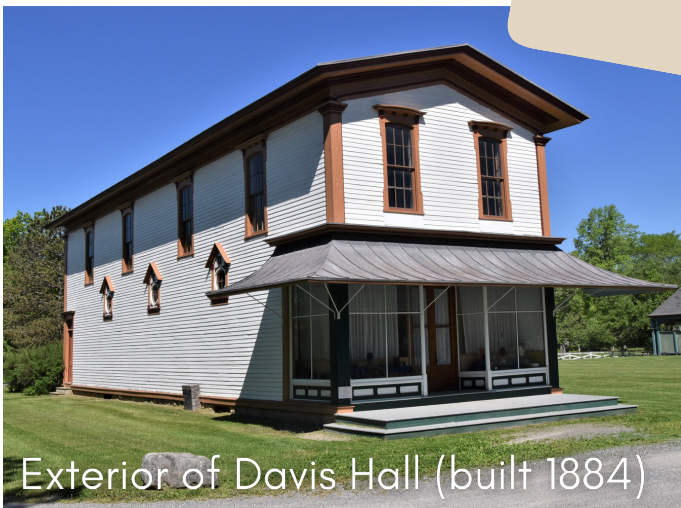
Exterior of Davis Hall (built 1884)

Join us for the exciting festival lead-up on April 5 - 7, or for totality on April 8!