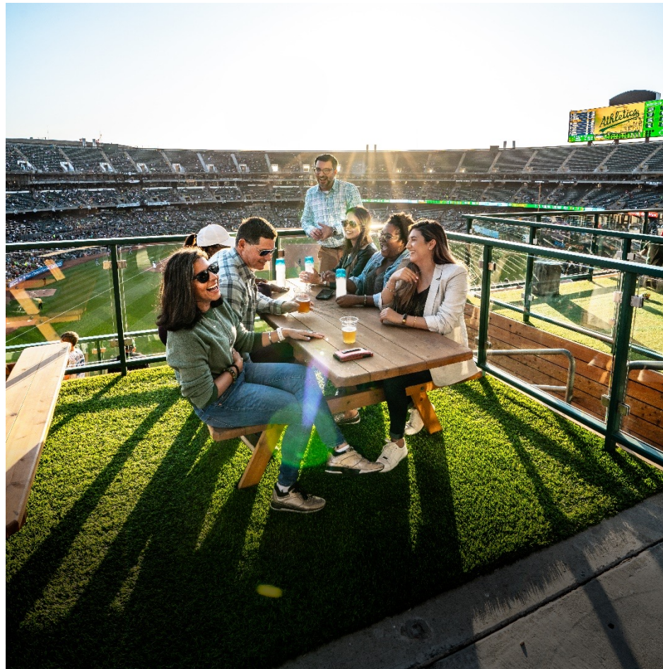
Director of Sales