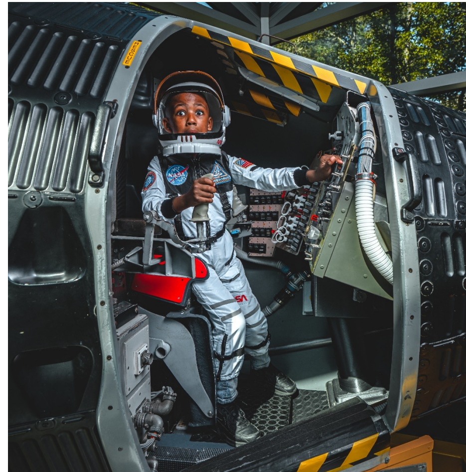
Director of Marketing