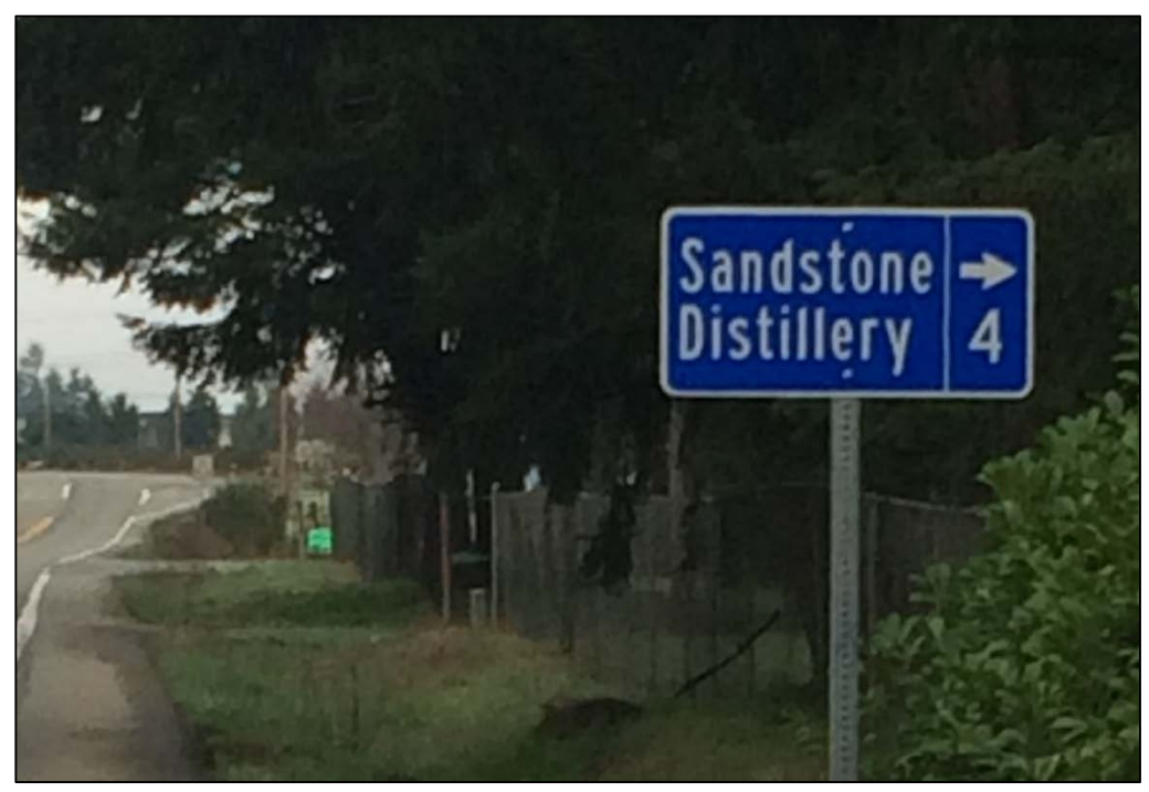
Example Sign Installation