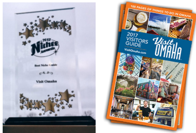
2017 Visitor Guide won a Niche Magazine Award for Best Guide book

The team is also responsible for Visit Omaha's network of social media channels, the consumer and partner e-newsletters, the Omaha Visitors Guide, and the Visit Omaha.com website. The Visit Omaha communication efforts focus on securing media coverage of Omaha, which in turn raises awareness of Omaha regionally and nationally. Impressions, engagement, reach and frequency are measurements used to gauge success, as well as increased visitation from targeted markets.