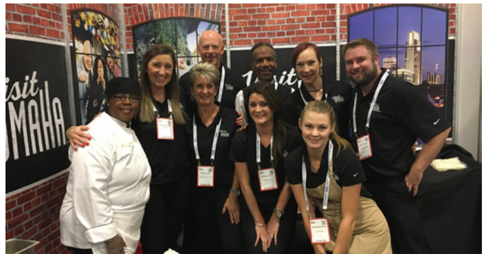
Visit Omaha tradeshow booth at 2017 IMEX America in Las Vegas