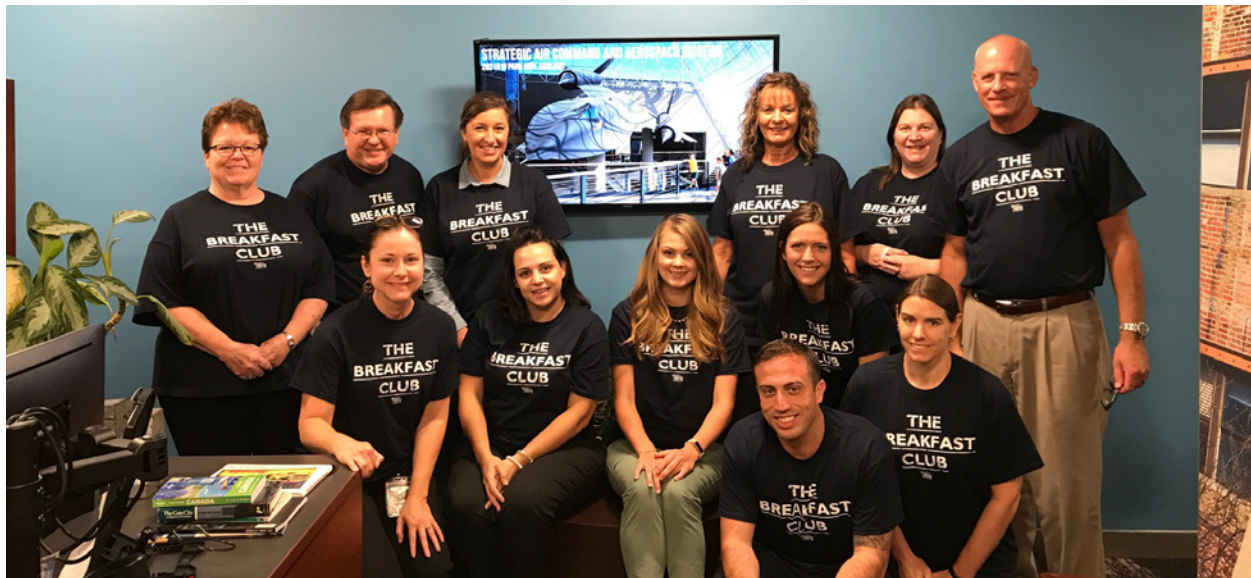
The sales and services team after providing the staff breakfast.