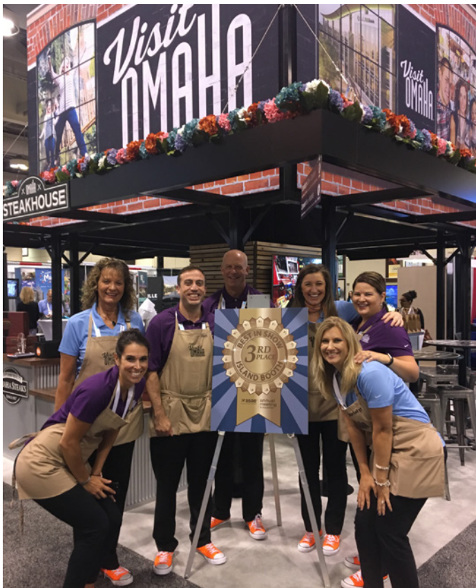
Visit Omaha tradeshow booth at 2017 ASAE Annual Expo in Toronto (3rd place out of 700 booths)

Visit Omaha's sales team markets Omaha to state, regional, national, and international corporations, associations, sports and motorcoach groups, with an emphasis on groups that will utilize facilities and hotel properties with meeting space. The sales team's activities fill hotel rooms, generate attendance to events, bring in tax dollars, and contribute to the overall economic health of the Omaha metropolitan area.