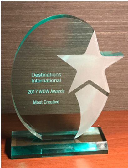
Bob 0.9K Marathon Campaign won 2017 Destinations International WOW Award for Most Creative