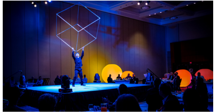
Oct 2017 - Trust for Insuring Educators Meeting at CenturyLink Center Omaha