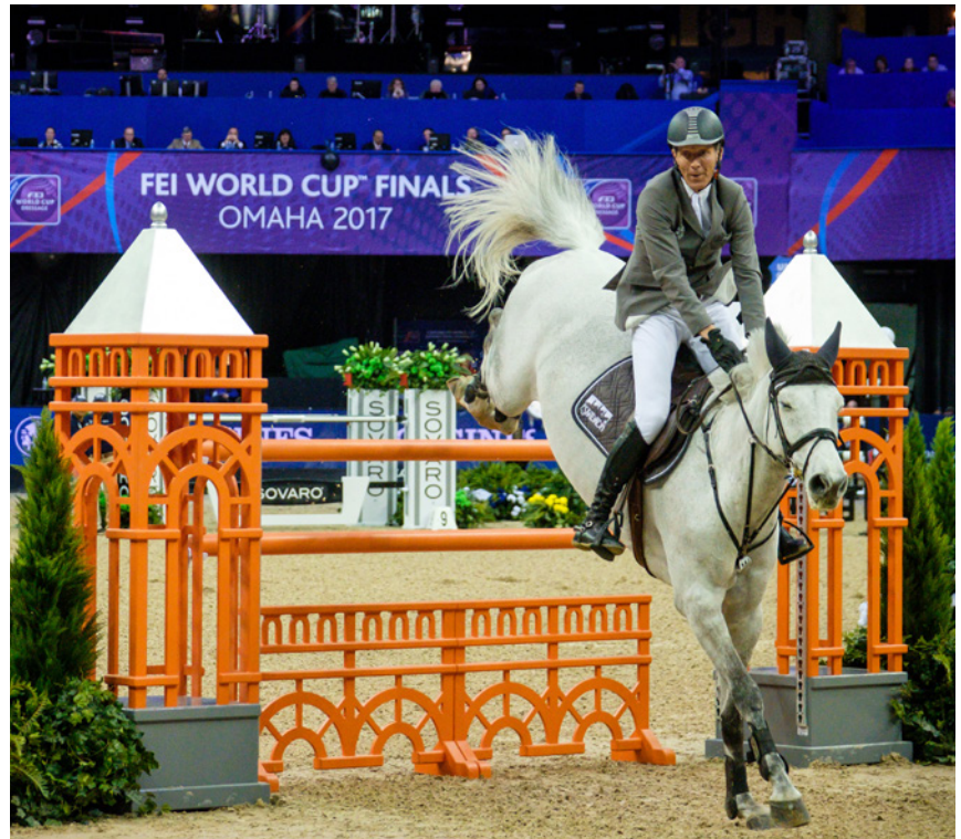
Visit Omaha's services team provided information and housing services during the 2017 FEI World Cup.