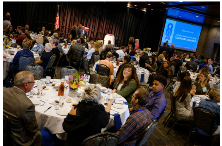
Omaha Metropolitan Area Tourism Awards

Expand and enhance the regional tourism awards program