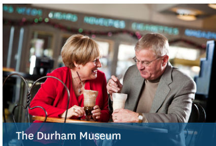
The Durham Museum