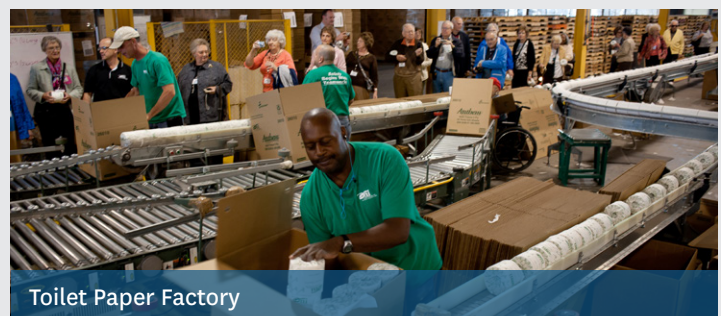
Toilet Paper Factory