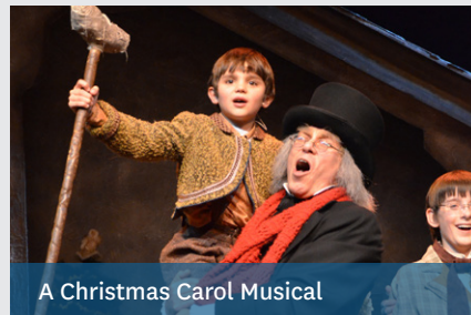
A Christmas Carol Musical