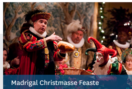
Madrigal Christmas Feasts