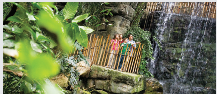
Omaha's Henry Doorly Zoo & Aquarium