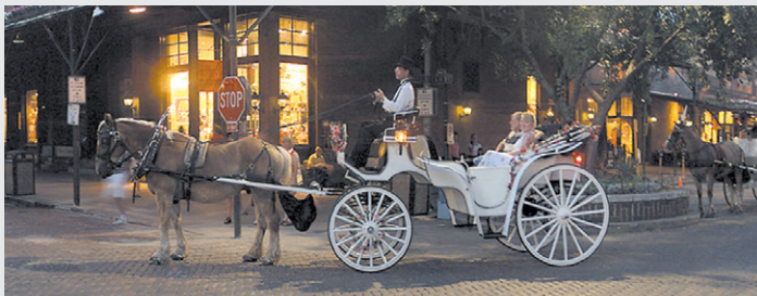
Omaha's Old Market Entertainment District