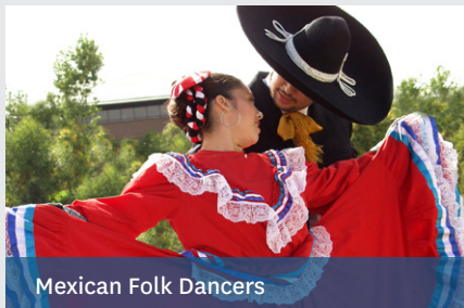
Mexican Folk Dancers