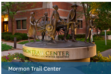
Mormon Trail Center