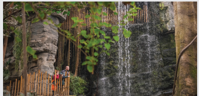
Omaha's Henry Doorly Zoo & Aquarium