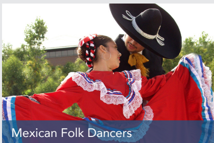
Mexican Folk Dancers

Tour groups will experience life as a billionaire and learn the fascinating story behind one of the richest men in the world, Warren Buffett. Visit his favorite restaurants, see where he works, and learn how he went from selling Coca-Cola for a nickel to owning one of the most powerful and respected conglomerates in the world. Tour Buffett-owned Nebraska Furniture Mart, one of the largest furniture stores in the world (and yes, they deliver), and shop at Borsheims, the largest independent jewelry store in the country.