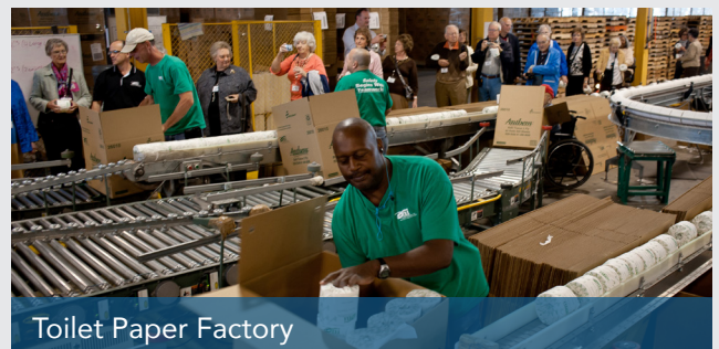
Toilet Paper Factory

Just a few miles to make your trip SHORT AND SWEET.