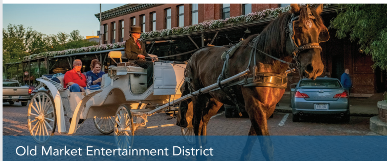
Old Market Entertainment District