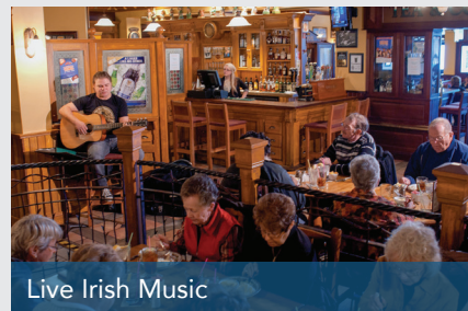
Live Irish Music

Experience a big taste of Ireland in Omaha. Feast on a "boxty," a traditional Irish luncheon dish sure to satisfy your group, and enjoy the delightful sounds of professional Irish performers—don't be surprised to hear sounds from a harp, penny whistle, and accordion. Take a tour of Father Flanagan's world-renowned Boys Town, a National Historic Landmark District, and say "cheers" with an Irish whiskey tasting.