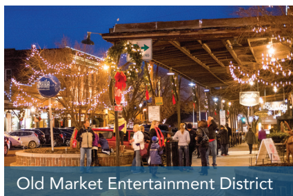
Old Market Entertainment District

History comes alive in Omaha. Swivel up to an old-fashioned soda fountain and enjoy a phosphate at The Durham Museum, Omaha's historic Art Deco train station. Visit the home of Civil War General George Crook and experience life as a frontier hero. Learn about the struggles and triumphs of the Mormon pioneers during their winter migration in 1846. Stroll around the Boys Town campus and feel the spiritual impact Father Edward Flanagan continues to make on the world. Discover hidden treasures in the historic riverboat community of Florence, nestled along the banks of the Missouri River.