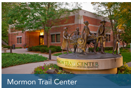
Mormon Trail Center