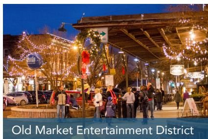
Old Market Entertainment District

History comes alive in Omaha. Swivel up to an old-fashioned soda fountain and enjoy a phosphate at The Durham Museum, Omaha's historic Art Deco train station. Visit the home of Civil War General George Crook and experience life as a frontier hero. Learn about the struggles and triumphs of the Mormon pioneers during their winter migration in 1846. Stroll around the Boys Town campus and feel the spiritual impact Father Edward Flanagan continues to make on the world. Discover hidden treasures in the historic riverboat community of Florence, nestled along the banks of the Missouri River.