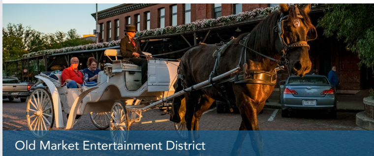
Old Market Entertainment District