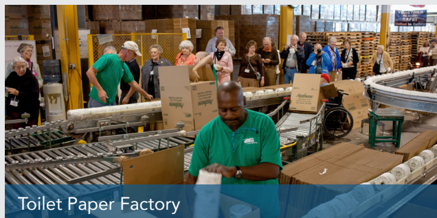
Toilet Paper Factory

Just a few miles to make your trip SHORT AND SWEET.