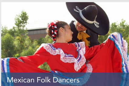
Mexican Folk Dancers

Tour groups will experience life as a billionaire and learn the fascinating story behind one of the richest men in the world, Warren Buffett. Visit his favorite restaurants, see where he works, and learn how he went from selling Coca-Cola for a nickel to owning one of the most powerful and respected conglomerates in the world. Tour Buffett-owned Nebraska Furniture Mart, one of the largest furniture stores in the world (and yes, they deliver), and shop at Borsheims, the largest independent jewelry store in the country.