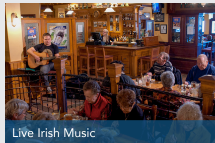
Live Irish Music

Experience a big taste of Ireland in Omaha. Feast on a "boxty," a traditional Irish luncheon dish sure to satisfy your group, and enjoy the delightful sounds of professional Irish performers—don't be surprised to hear sounds from a harp, penny whistle, and accordion. Take a tour of Father Flanagan's world-renowned Boys Town, a National Historic Landmark District, and say "cheers" with an Irish whiskey tasting.