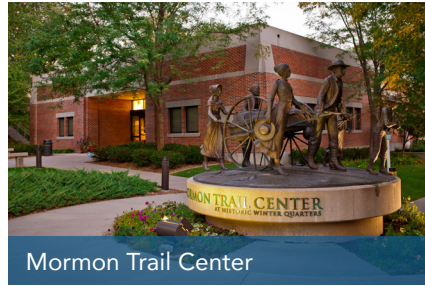
Mormon Trail Center