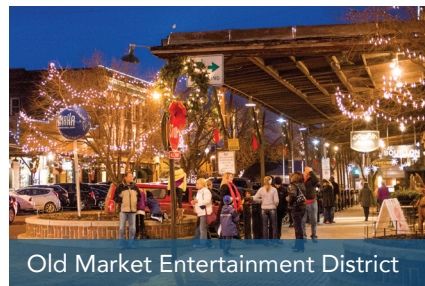
Old Market Entertainment District

History comes alive in Omaha. Swivel up to an old-fashioned soda fountain and enjoy a phosphate at The Durham Museum, Omaha's historic Art Deco train station. Visit the home of Civil War General George Crook and experience life as a frontier hero. Learn about the struggles and triumphs of the Mormon pioneers during their winter migration in 1846. Stroll around the Boys Town campus and feel the spiritual impact Father Edward Flanagan continues to make on the world. Discover hidden treasures in the historic riverboat community of Florence, nestled along the banks of the Missouri River.