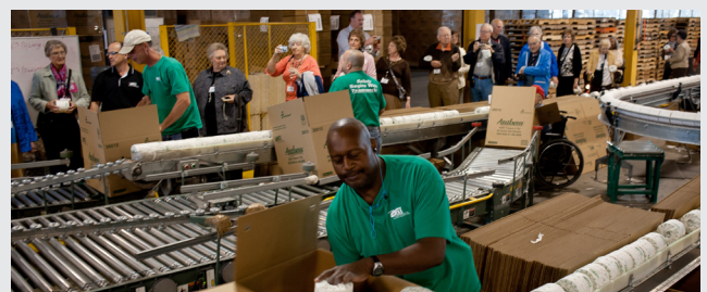
Toilet Paper Factory