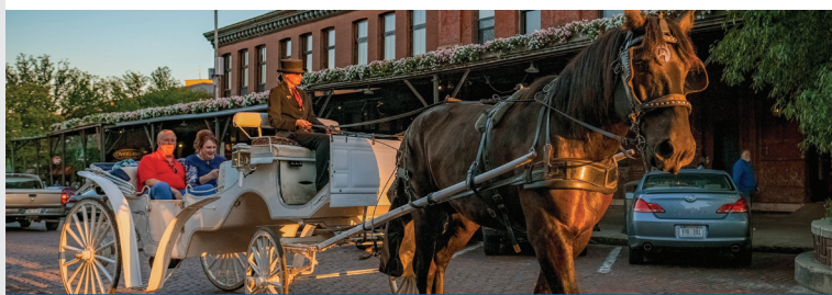
Old Market Entertainment District