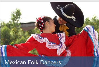
Mexican Folk Dancers

Tour groups will experience life as a billionaire and learn the fascinating story behind one of the richest men in the world, Warren Buffett. Visit his favorite restaurants, see where he works, and learn how he went from selling Coca-Cola for a nickel to owning one of the most powerful and respected conglomerates in the world. Tour Buffett-owned Nebraska Furniture Mart, one of the largest furniture stores in the world (and yes, they deliver), and shop at Borsheims, the largest independent jewelry store in the country.