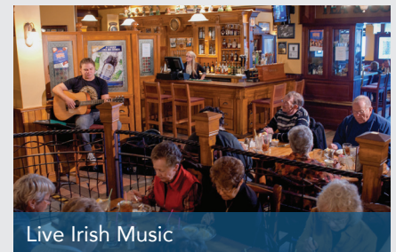
Live Irish Music

Experience a big taste of Ireland in Omaha. Feast on a "boxty," a traditional Irish luncheon dish sure to satisfy your group, and enjoy the delightful sounds of professional Irish performers—don't be surprised to hear sounds from a harp, penny whistle, and accordion. Take a tour of Father Flanagan's world-renowned Boys Town, a National Historic Landmark District, and say "cheers" with an Irish whiskey tasting.