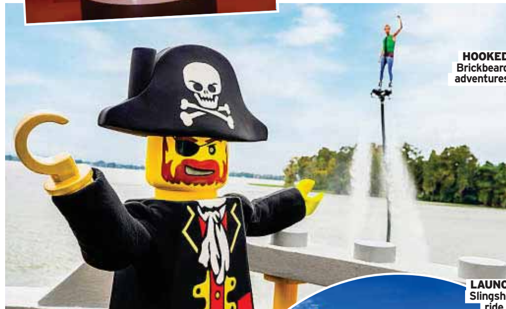
HOOKED Brickbeard adventures