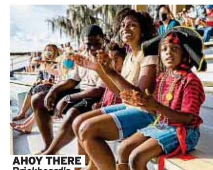
AHOY THERE Brickbeard's Watersports Stunt Show

The outdoor festival covers comedy, pop and opera with the audience in private pods for up to five people, with takeaway food and