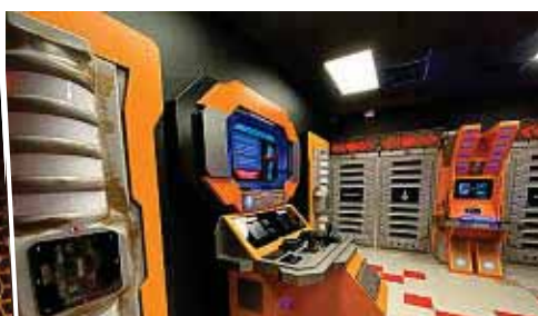
ARCADE FIRE The Game, ICON Park