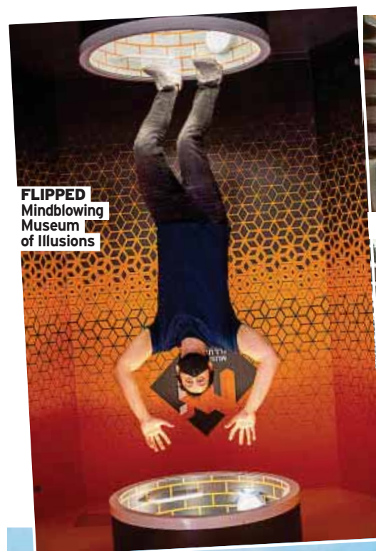
FLIPPED Mindblowing Museum of Illusions

Saga is for people over 50. Our overseas holidays include travel insurance underwritten by Great Lakes Insurance SE, UK Branch, or a price reduction if not required. Cover is subject to medical screening. Terms and conditions apply – call for details. For full details of our Coronavirus Vaccination Policy please visit saga.co.uk/booking-conditions . For more information about financial protection and the ATOL Certificate, visit www.atol.org.uk/ATOLCertificate . NHA-GH1397