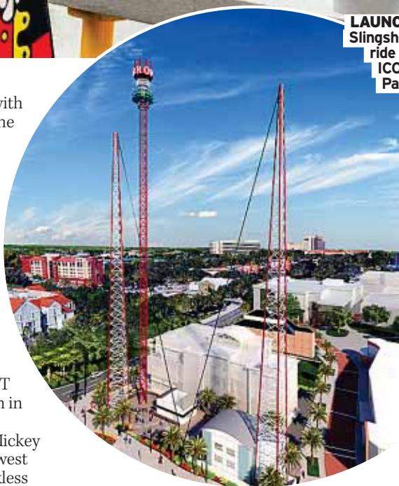
LAUNCH Slingshot ride at ICON Park

Over at Disney's Hollywood Studios, Mickey and Minnie's Runaway Railway is the newest attraction and uses state-of-the-art trackless technology to bring the mice's cartoon world to life. Disney say it's a "whirlwind ride through a world where the rules of physics don't apply". Already open. disneyworld.co.uk