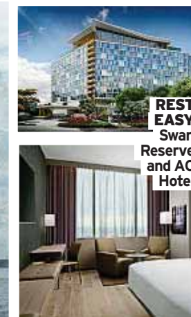
REST EASY Swan Reserve and AC Hotel