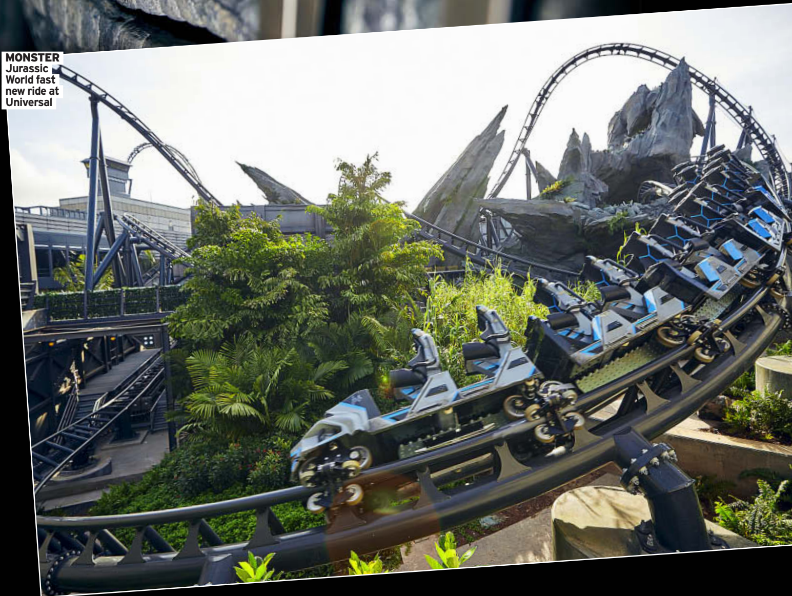
MONSTER Jurassic World fast new ride at Universal

The world's theme park capital never rests on its big-hitting holiday laurels. Even in the face of a pandemic, Orlando is not standing still and is raring to go as restrictions ease across the Sunshine State.