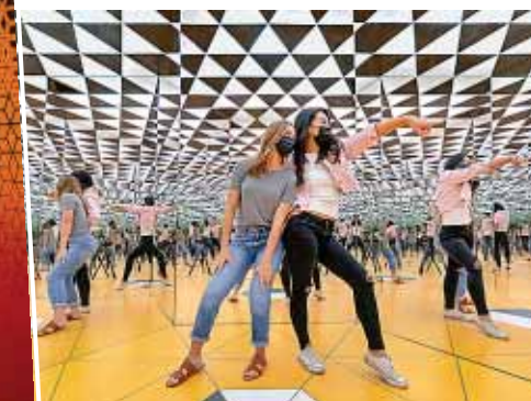
BAFFLING Immersive Museum of Illusions