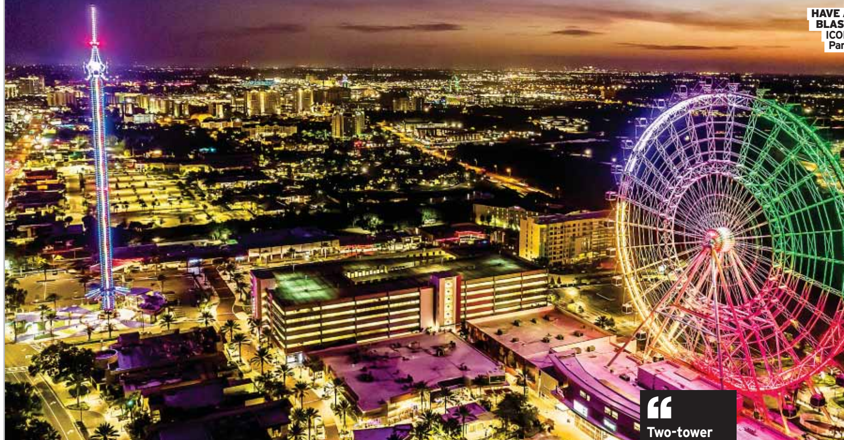
HAVE A BLAST ICON Park

Two-tower attraction launches riders out of an exploding volcano