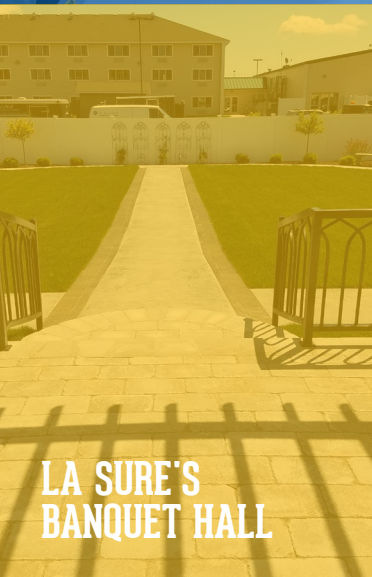
LA SURE'S BANQUET HALL