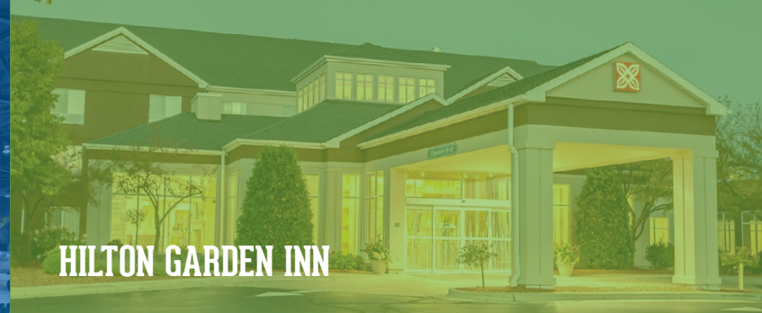
HILTON GARDEN INN