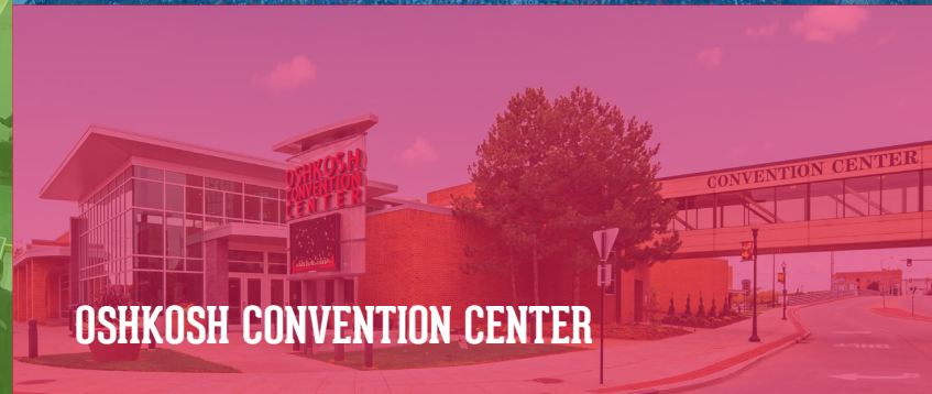
OSHKOSH CONVENTION CENTER