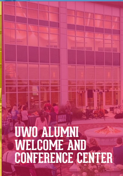
UWO ALUMNI WELCOME AND CONFERENCE CENTER