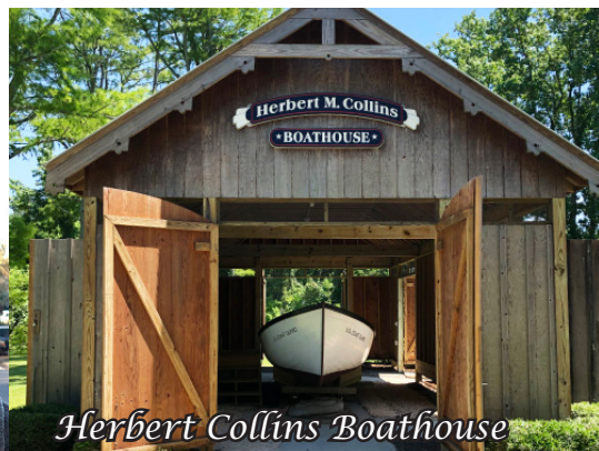
Herbert Collins Boathouse