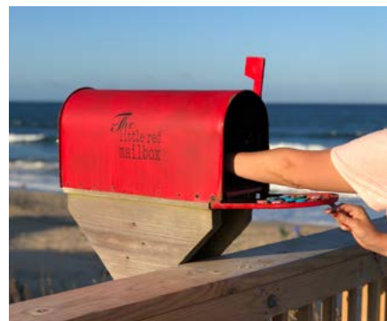
THE LITTLE RED MAILBOX

Jockey's Ridge State Park is known for having the tallest sand dunes on the east coast. What most folks don't know is that this state park also has hiking trails. These paths lead through the dunes, opening up to the sound, with markers and info panels along the way.