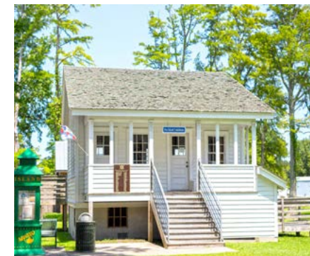
PEA ISLAND COOKHOUSE