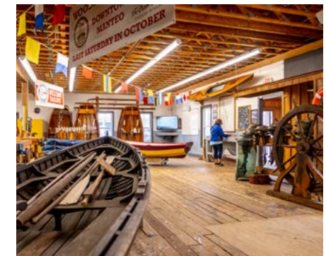
ROANOKE ISLAND MARITIME MUSEUM