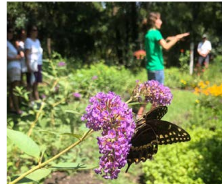
DARE COUNTY ARBORETUM

Just past the Cape Hatteras Lighthouse on Cape Hatteras National Seashore, you'll find Buxton Woods. This is a 1,007 acre expanse of maritime forest perfect for nature lovers and hikers of all ages. Many white-tailed deer call this area home, don't be surprised if you see them in broad daylight.