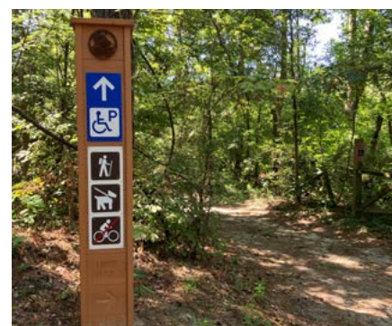
NAGS HEAD WOODS PRESERVE

Some of the best hiking can be found at Nags Head Woods Ecological Preserve. Hiking trails are open from dawn to dusk year-round and offer great views of sand dunes, ponds, marshes and history. The Roanoke Trail is a local favorite, consisting of a short 1.5 mile round trip.