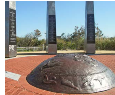
CENTURY OF FLIGHT MONUMENT