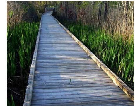
SANDY RUN PARK