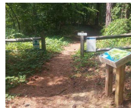
KITTY HAWK WOODS