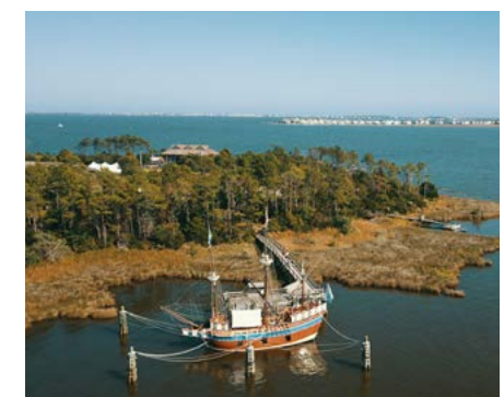
ROANOKE ISLAND FESTIVAL PARK