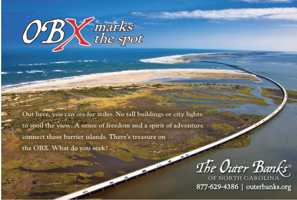
This ad ran in the July/August issue of AAA World

The Outer Banks Visitors Bureau has been integrating the concept of "OBX Marks The Spot" for a few months now in print publications and online. You may have seen some of these in Our State magazine, Woman's Day, and some of the AAA publications to name a few. The premise is that no matter where on the OBX you keep your heart, whether it's the food, family, the recreation or history, there's a spot for you...certain spots are bound to your imagination and sense of adventure. You may also have seen the "OBX Marks The