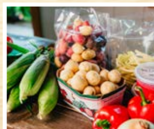
Farm Markets are back