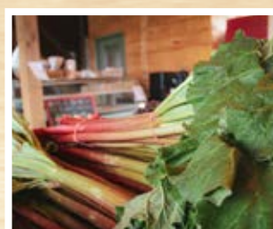
Rhubarb for your baking