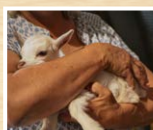
Bookable goat cuddling