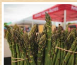
Asparagus by the bundle