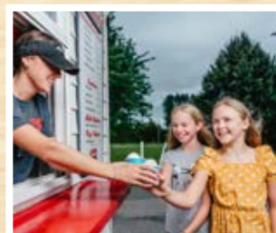
Ice Cream Shops Open