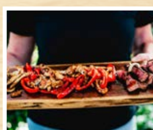
Protein on the Grill