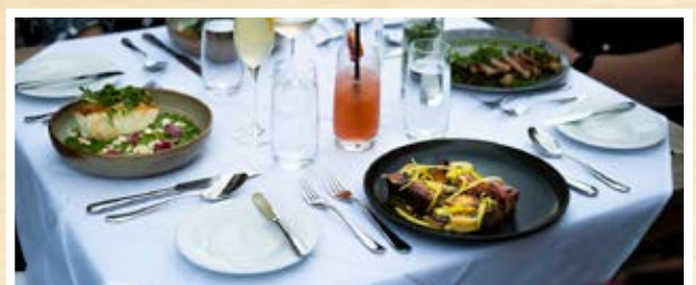
Garden Ingredients on Restaurant Menus!