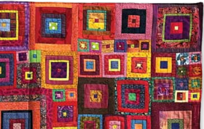
"Jewel Squares Blind" by Kaffe Fassett and Liza Prior Lucy, Kaffe: 85 & Fabulous