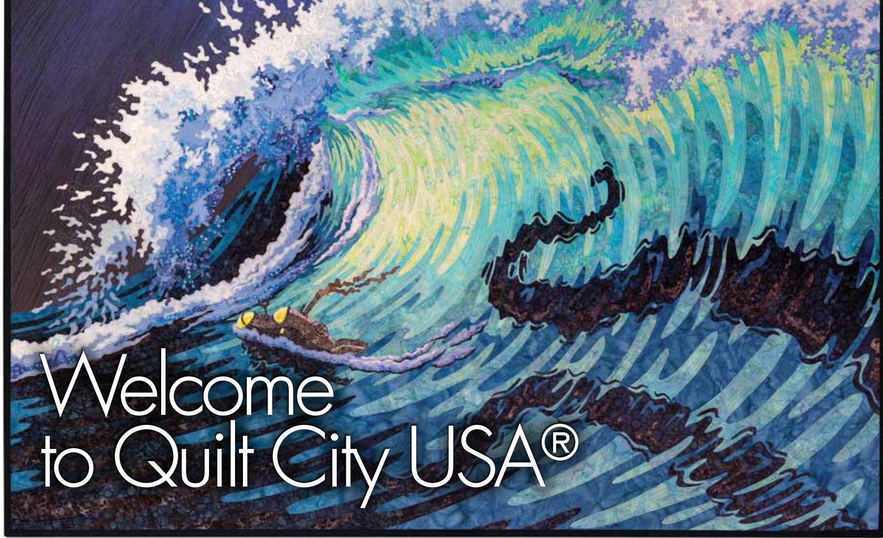
"There's Something In the Water" by Kestrel Michaud, SAQA: Light the World