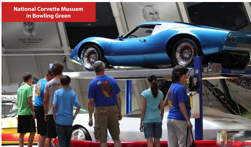
National Corvette Museum in Bowling Green