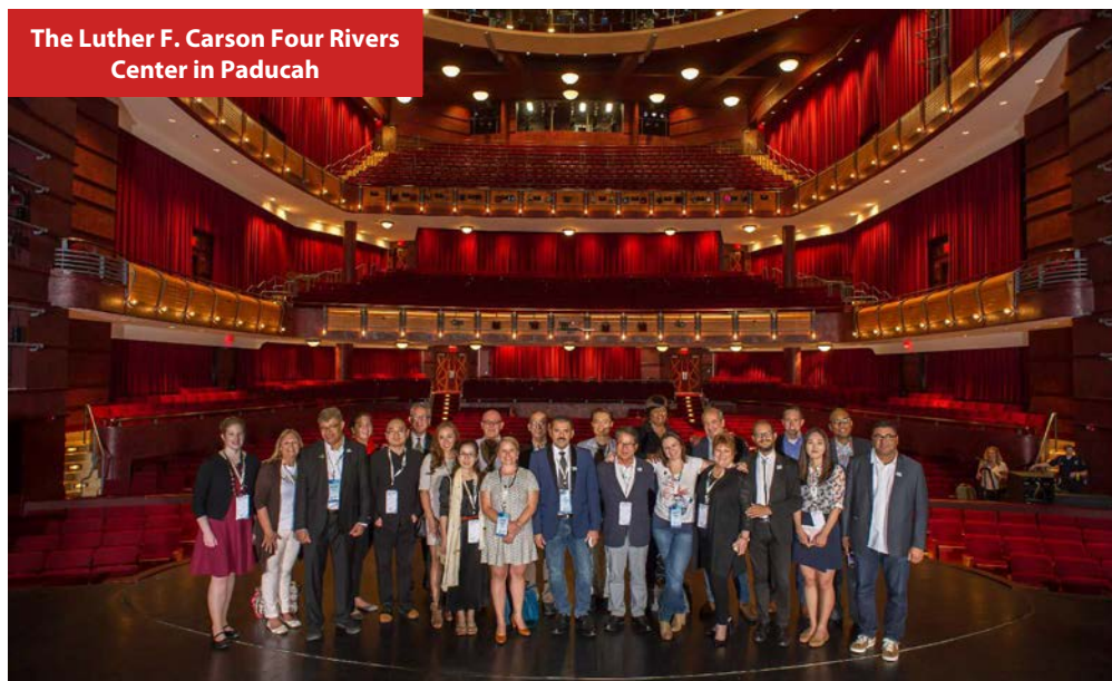
The Luther F. Carson Four Rivers Center in Paducah

Kentucky's official outdoor drama, The Stephen Foster Story , is staged at My Old Kentucky Home State Park, home of Federal Hill, where America's first composer, Stephen Foster, was inspired to write the state's anthem. The park has indoor and outdoor event spaces that can accommodate up to 300 for a seated event or up to 350 for a reception. My Old Kentucky Dinner Train can seat up to 170 for dinners.