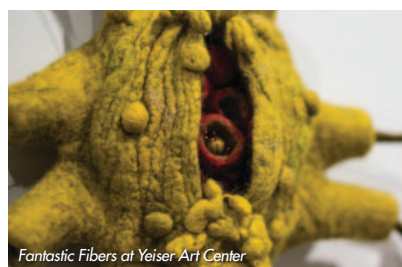
Fantastic Fibers at Yeiser Art Center