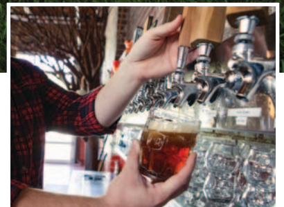
Savor Local Flavor

Creativity is the common thread that connects people from around the world to Paducah, Kentucky's rich American heritage and globally-celebrated culture.