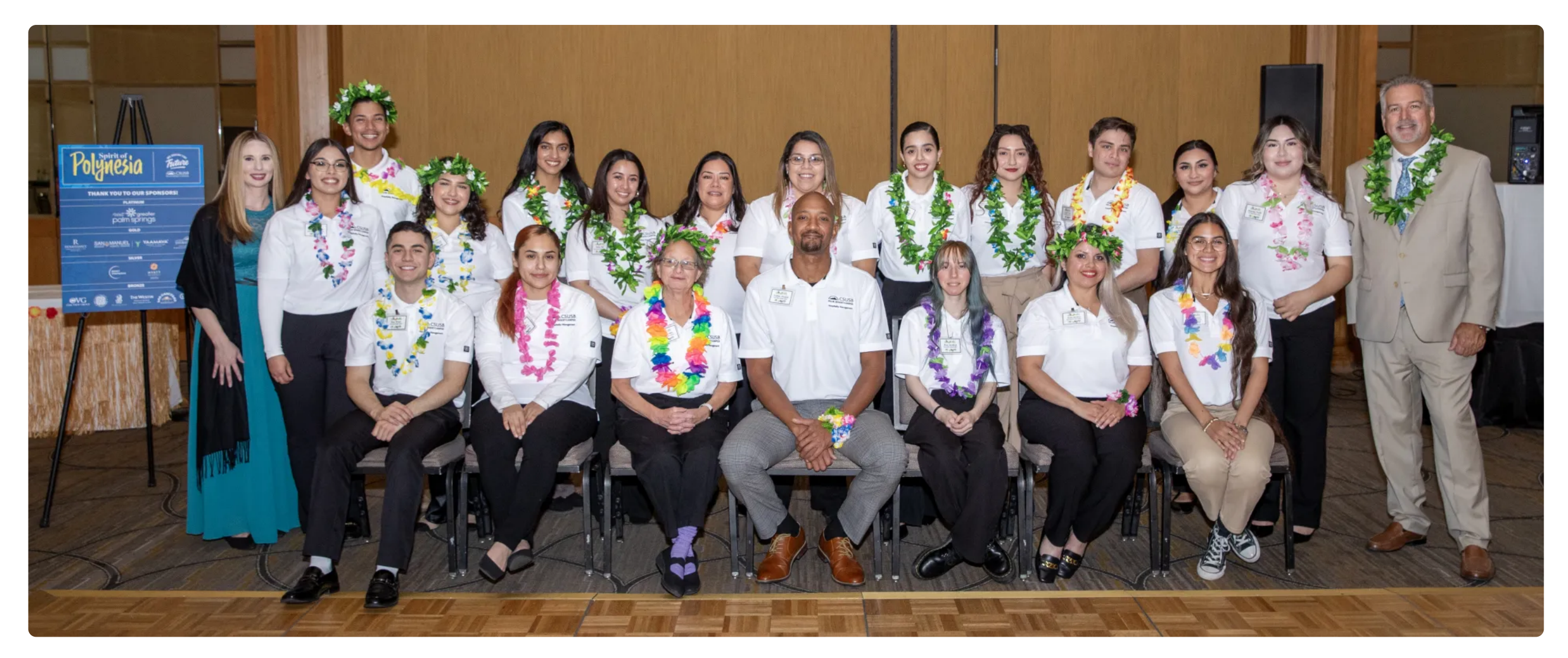
Students and faculty at the "Spirit of Polynesia" gala hosted by the CSUSB Palm Desert Campus on April 27, 2024 at the Renaissance Esmeralda Resort & Spa Indian Wells.

The richness of Polynesian culture was on full display as the Palm Desert Campus of Cal State San Bernardino celebrated and supported its hospitality management program on April 27 at the Renaissance Esmeralda Resort & Spa Indian Wells.