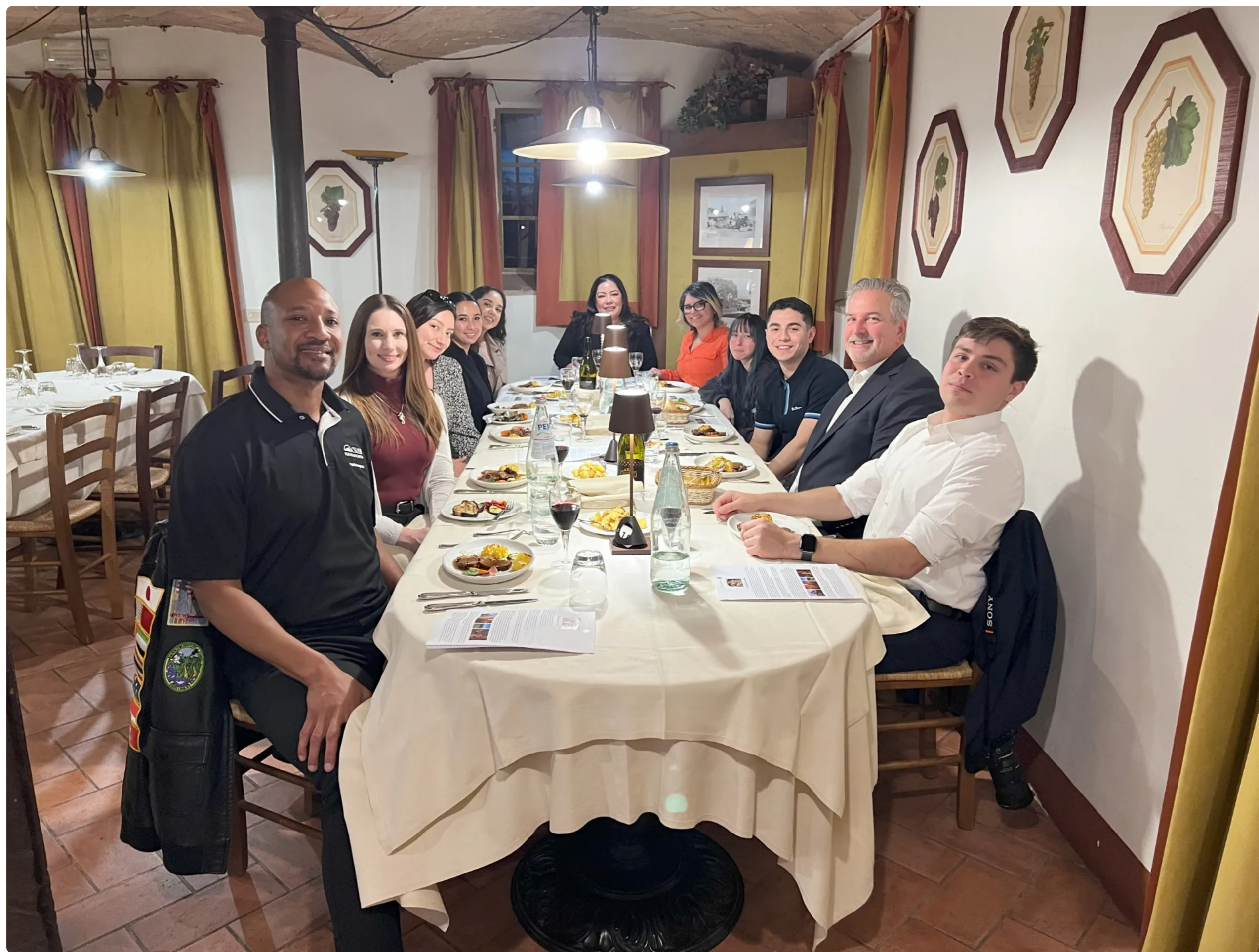
CSUSB Palm Desert Campus hospitality management students enjoy a meal during their trip to Italy.

Hospitality management and business students, from both the CSUSB Palm Desert and San Bernardino campuses, recently returned from a short-term study abroad trip to Italy.