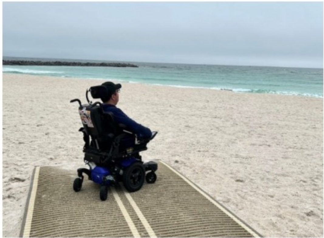
MOBI-MATS INSTALLED FOR BEACH ACCESS

May is National Mobility Awareness Month, so it’s only fitting that Panama City Beach, Florida, just kicked off its “Fun.For.All.” initiative to highlight the destination’s commitment to accessible travel.