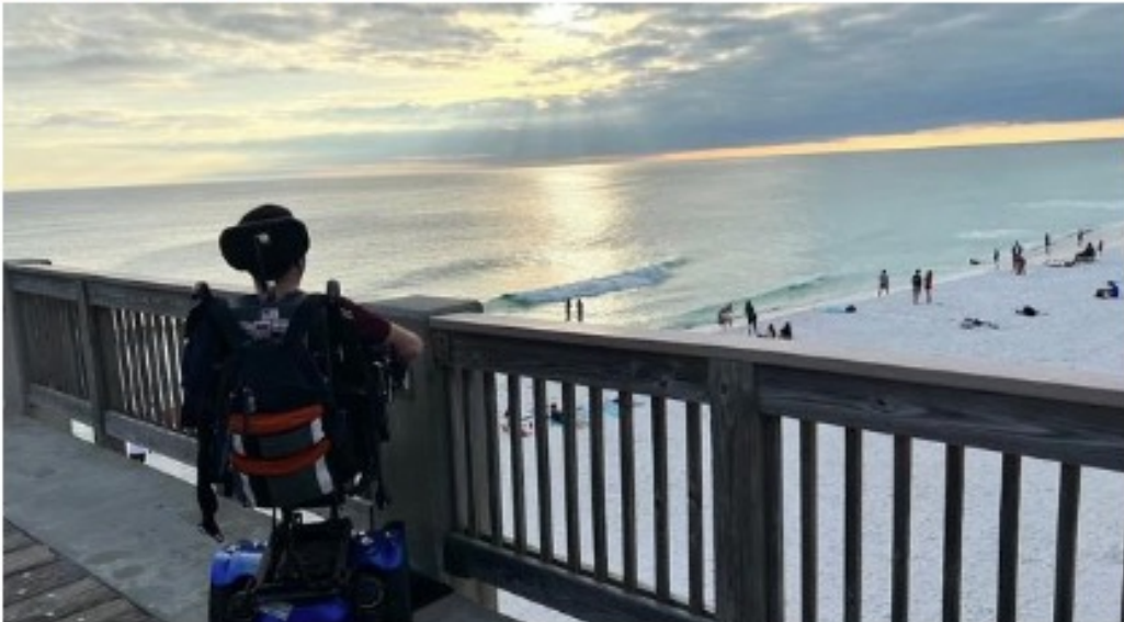
Panama Beach City features elevated boardwalks and wheelchair rentals for travelers with mobility issues.

DESTINATION & TOURISM | CLAUDETTE COVEY | MAY 11, 2022