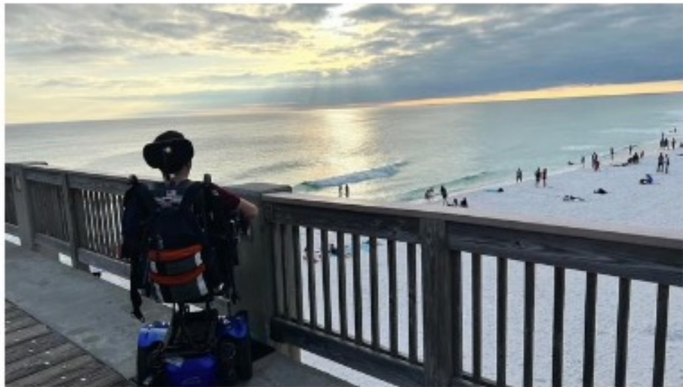
Panama City Beach features elevated boardwalks and wheelchair rentals for travelers with mobility issues.

As a source of destination inspiration, we look at five diverse DMOs doing different things as they explore and explain the impact of tourism.