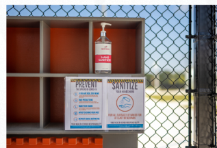
Hand sanitizing stations