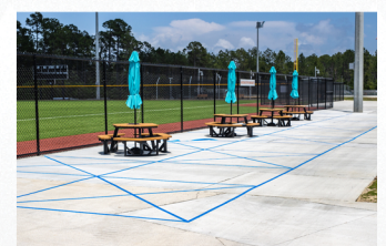
Clearly marked social distancing spaces