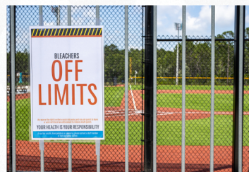
Highly visible signage