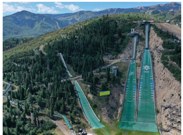
Visitors can experience the glory of the 2002 Winter Games at Utah Olympic Park . Museum tours highlight the history of all skiing disciplines through touch screen displays, videos, a VR ski theater, and maps.