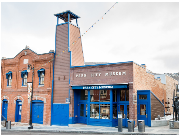
An interactive pictorial of Park City's colorful mining and ski history is on display at the Park City Museum , located at 528 Main Street in the heart of Park City's Historic Old Town district.