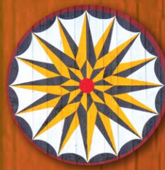
16-Pointed Star Success, Prosperity, Fertility, the Sun