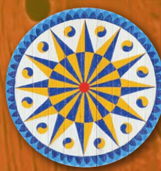
12-Pointed Star the 12 Months, or 12 Apostles Scallop Border Tranquility, Smooth Sailing