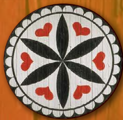
6-Pointed Rosette Good Luck, the flower of life, the Morning Star, 6 Biblical Days of Creation

In the 1950s, with the rise of regional tourism, the art form changed from the strictly geometric designs found on barns to include other folk art motifs such as hearts, flowers, and birds which were painted on commercial sign board. It also became popular to attribute specific meanings to the star patterns painted on barns. Many of these explanations can be traced to the 20th-century forms of the art. In fact, many of the design interpretations can be directly linked to folk art painters like Johnny Ott of Lenhartsville, Jacob Zook of Lancaster, and Johnny Claypoole of Lenhartsville. Some basic interpretations of barn star art include: