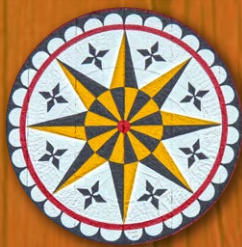
8-Pointed Star The most popular barn star in Berks County, Sun, Fertility, the Compass rose