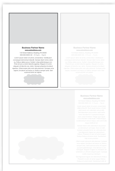
Quarter Page Ad Size