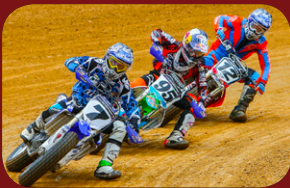
Grand National Championship TT August 13