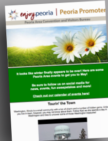
Click for our bi-monthly Peoria Promoter