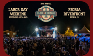
Peoria Blues & Heritage Festival September 1-2