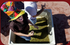
Mackinaw Valley Vineyard Grape Stomp & Harvest Fest September 3