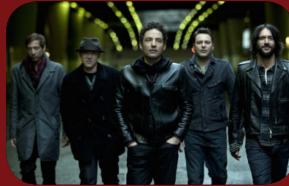
The Wallflowers with Better than Ezra August 6

See more events on our website: www.EnjoyPeoria.com/Events