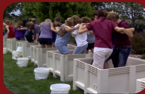
Kickapoo Creek Grape Stomp August 27