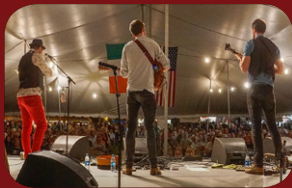
Peoria Irish Fest Erin Feis August 25-27