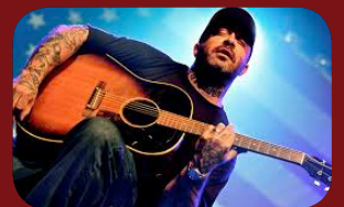
Tailgate 'N Tallboys Music Festival September 28-30