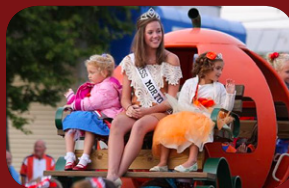
Morton Pumpkin Festival September 13-16