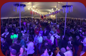
Peoria Oktoberfest September 15-17