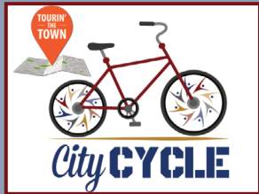
Tourin' the Town City Cycle