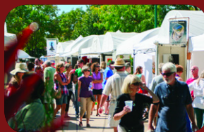
Peoria Fine Art Fair September 23-24