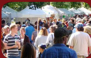
Pekin Marigold Festival September 7-10