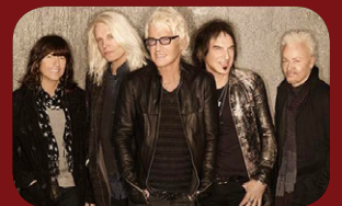
REO Speedwagon Peoria Civic Center September 15