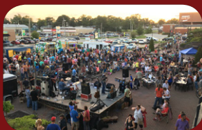
Food Truck Frenzy September 16