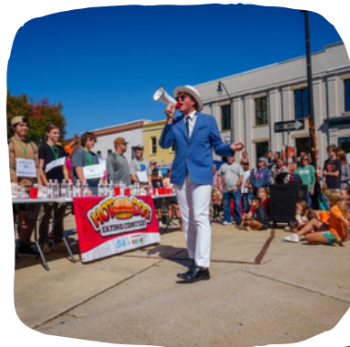
2024 Personality Festival

State tax revenue generated in Person County totaled $2.24 million through state sales and excise taxes (2024)