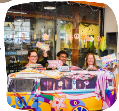
2024 All Carolina’s Shop Hop at Contextures Fabrics