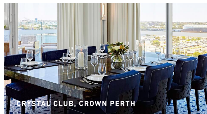
CRYSTAL CLUB, CROWN PERTH