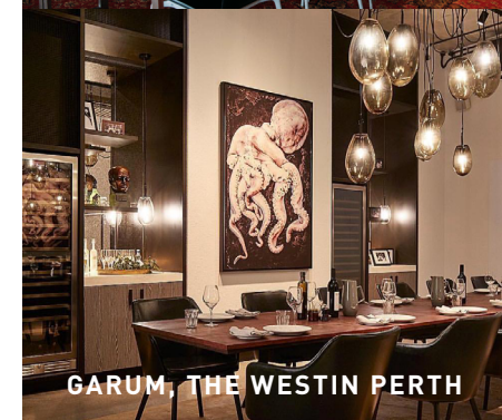
GARUM, THE WESTIN PERTH