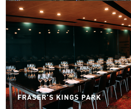
FRASER'S KINGS PARK