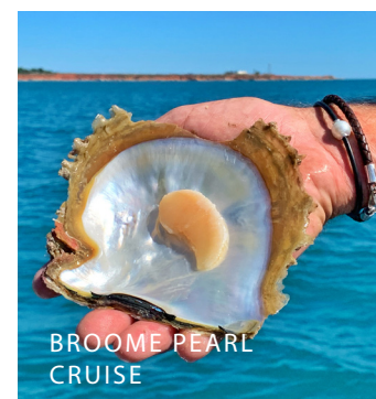
BROOME PEARL CRUISE