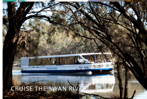
CRUISE THE SWAN RIVER