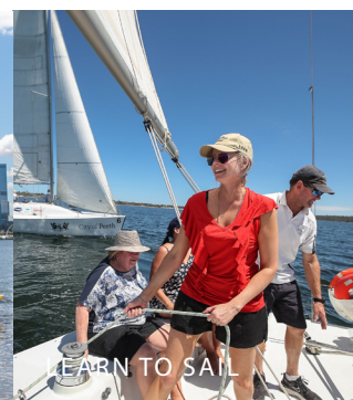
LEARN TO SAIL