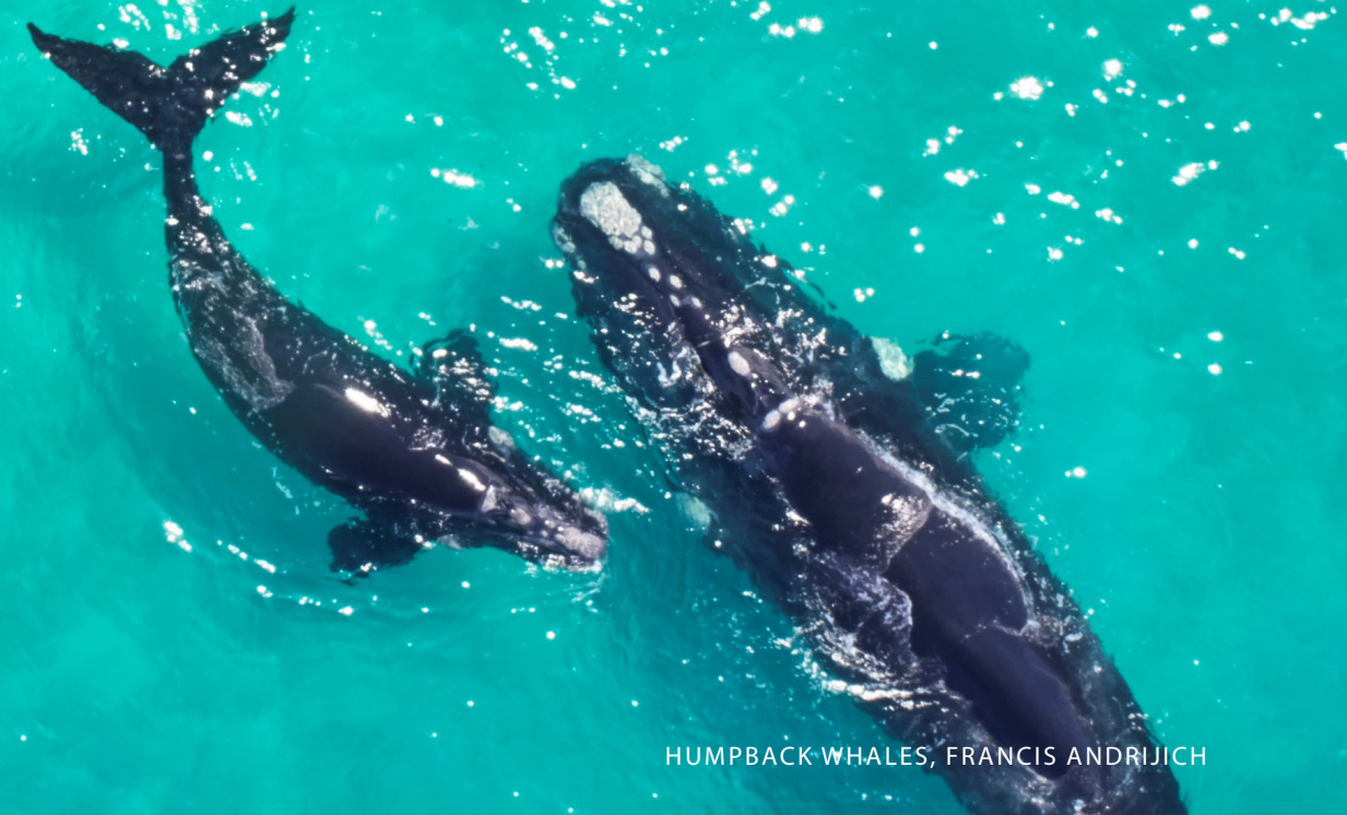
HUMPBAC WHALES

Naturaliste Charters operate as the leading whale watchers in the Margaret River Wine Region and are the perfect providers for your next incentive travel experience. Marvel at the majestic nature of Humpback, Southern Right, Minke and Blue Whales as they swim and play within metres of the vessel.