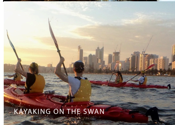
KAYAKING ON THE SWAN