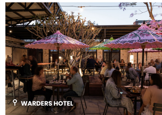
📍 WARDERS HOTEL