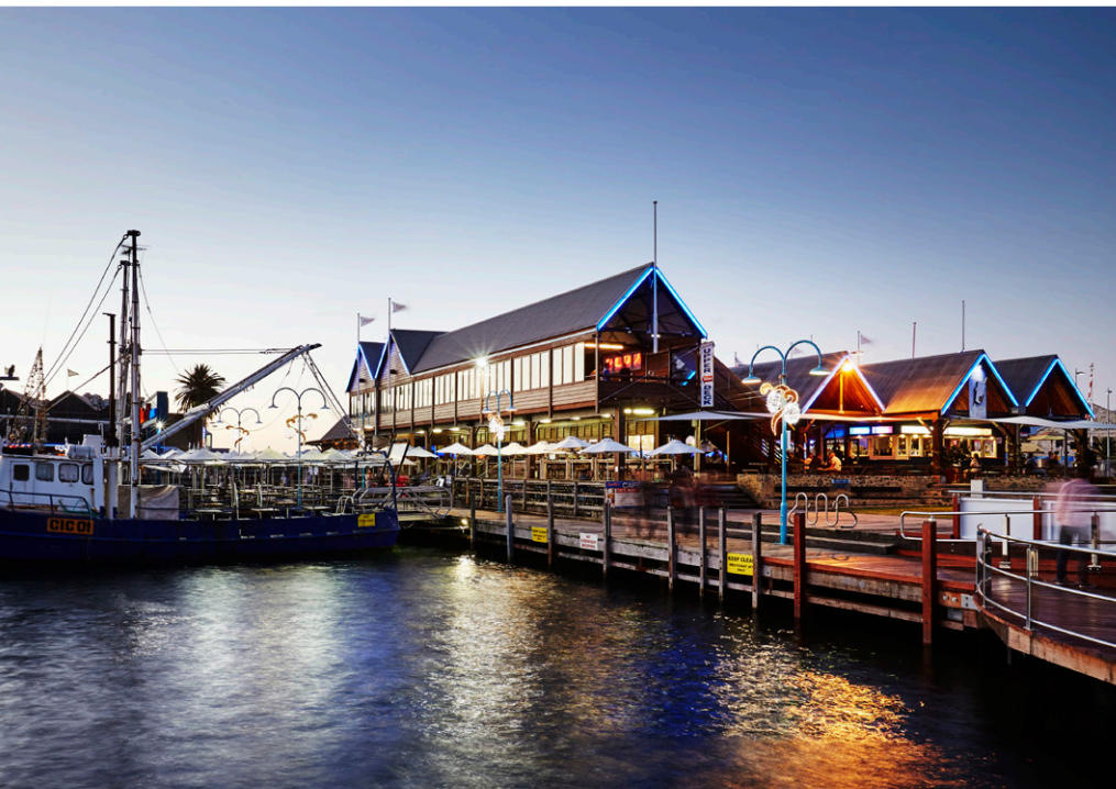
📍 FISHING BOAT HARBOUR

experiences in WA. Step inside and enjoy the distinctive atmosphere of over a hundred years of vibrant culture and heritage. Browse an eclectic mix of stalls offering everything from local produce to handmade crafts.