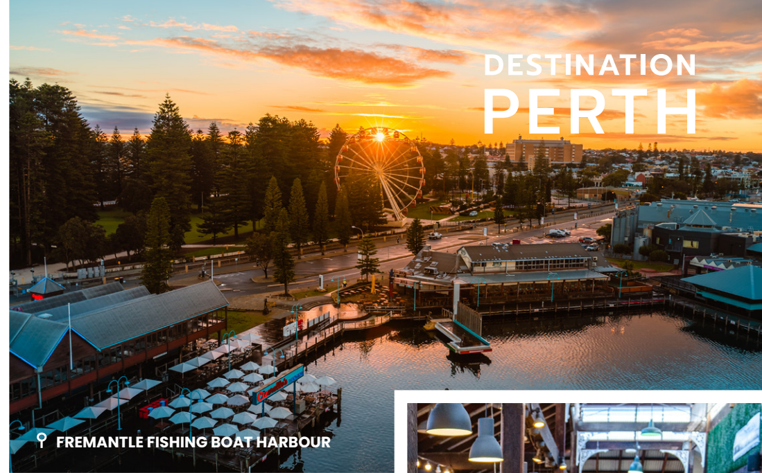
FREMANTLE FISHING BOAT HARBOUR

5PM // Spend the evening exploring the vibrant streets of Fremantle. Watch a film at Luna Cinemas , see a live music show, or unwind at one of the award-winning restaurants before bar hopping the night away. In the heart of Fremantle is FOMO – a blend of art, architecture, culture, and dining, all under one roof. Tend to your appetite in the hawker-style food court and run wild in FunLab with Strike Bowling , Holey Moley mini golf, arcade games and more.