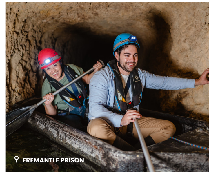
📍 FREMANTLE PRISON