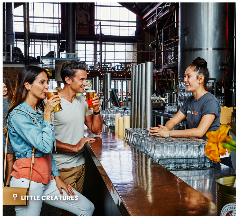
📍 LITTLE CREATURES