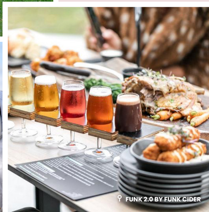
♀ FUNK 2.0 BY FUNK CIDER