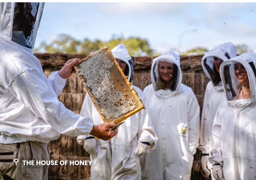
♀ THE HOUSE OF HONEY