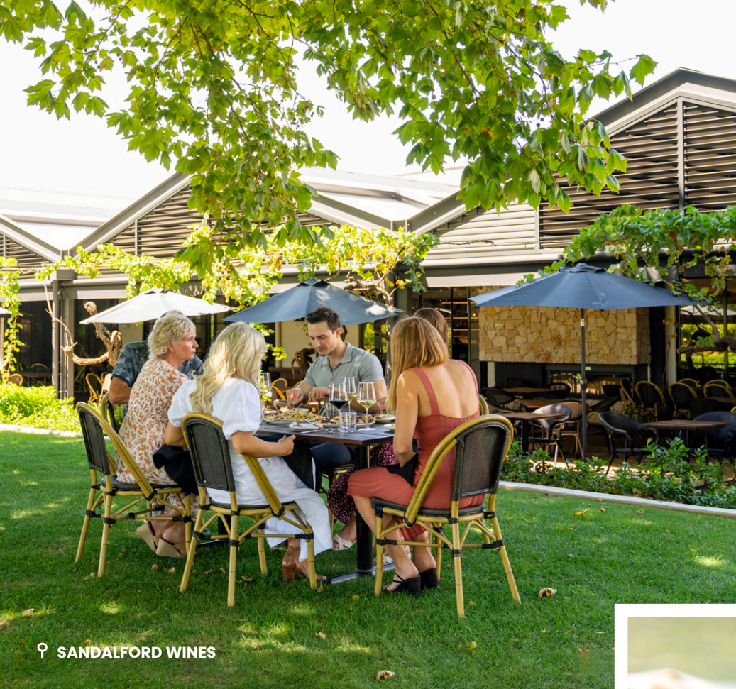
♀ SANDALFORD WINES