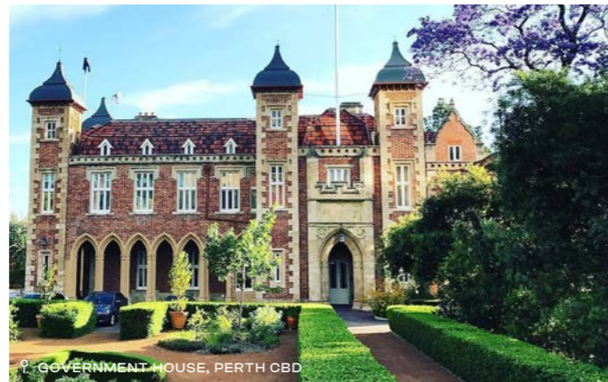
GOVERNMENT HOUSE, PERTH CBD

Arrive Perth, check into Duxton Hotel. Explore Perth's surprising urban green spaces as you explore inner-city parks and gardens including Stirling, Supreme Court, Government House and Harold Boas Gardens dotted among historic and modern architecture of this exciting new city. TRIBE Hotel in West Perth is within walking distance of Kings Park.