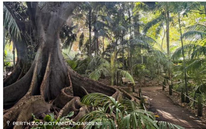
PERTH ZOO BOTANICAL GARDENS

Explore Perth Zoo's botanical landscapes and wildlife. Enjoy breakfast at Elizabeth Quay before catching the ferry to South Perth and exploring the riverfront vistas and relaxed urban landscapes.