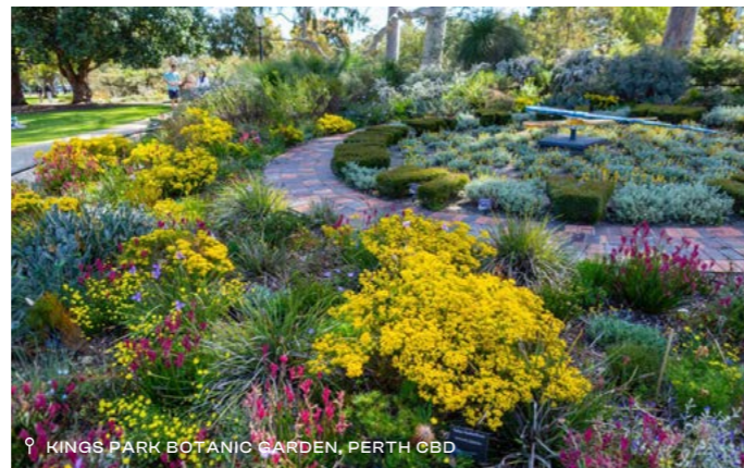
KINGS PARK BOTANIC GARDEN, PERTH CBD

Discover Perth's premier garden, Kings Park, the jewel in Perth's crown, covering an area larger than New York's Central Park with landscaped and natural bushland. Enjoy a guided cultural tour before a signature garden-to-plate dining experience overlooking the Swan River at Fraser's Restaurant. Later wander through Queens Gardens, Point Fraser, Ozone Reserve and witness kangaroos on Heirisson Island while riding a segway across Boorloo Bridge.