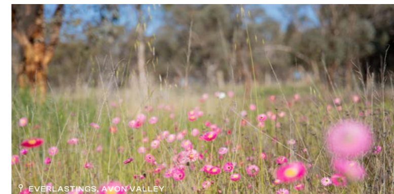
EVERLASTINGS, AVON VALLEY

Enjoy a curated Mystery Picnic through Chittering, exploring Bindoon's orchards, plantations and artisan producers, complemented by wildlife encounters and immersive regional storytelling at Limestone Park Stud, a botanical aviary and cafe in the Northern Valleys.