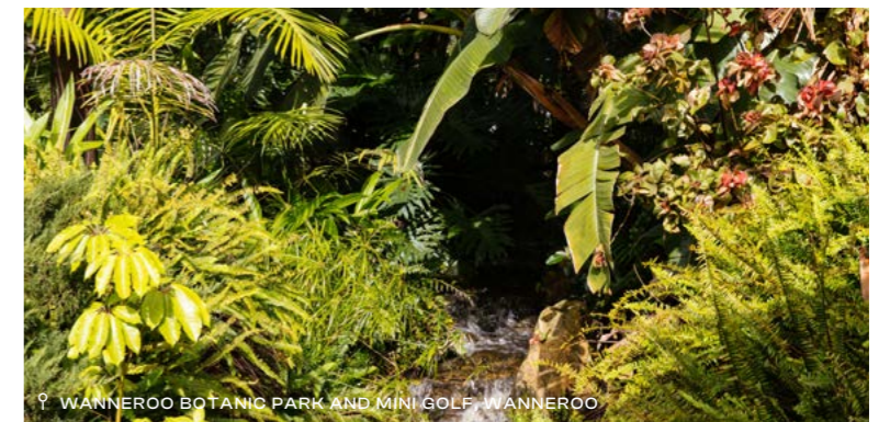
WANNEROO BOTANIC PARK AND MINI GOLF, WANNEROO

Travel north to Yanchep National Park to meet koalas and dingoes, before discovering the underwater wonderland of WA's State Aquarium with its sharks and coral nursery. Finish the day with a round of mini-golf at Wanneroo Botanic Gardens before a luxurious overnight stay at Joondalup Resort.