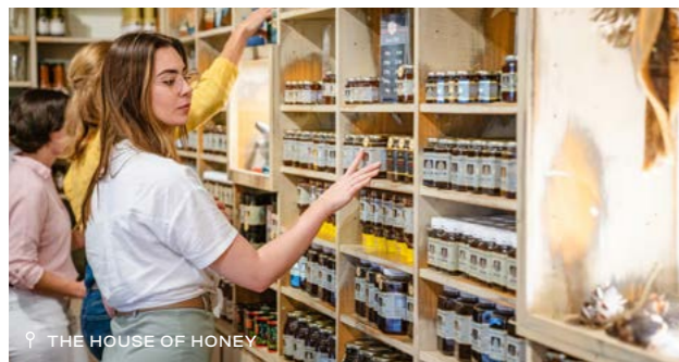
♀ THE HOUSE OF HONEY