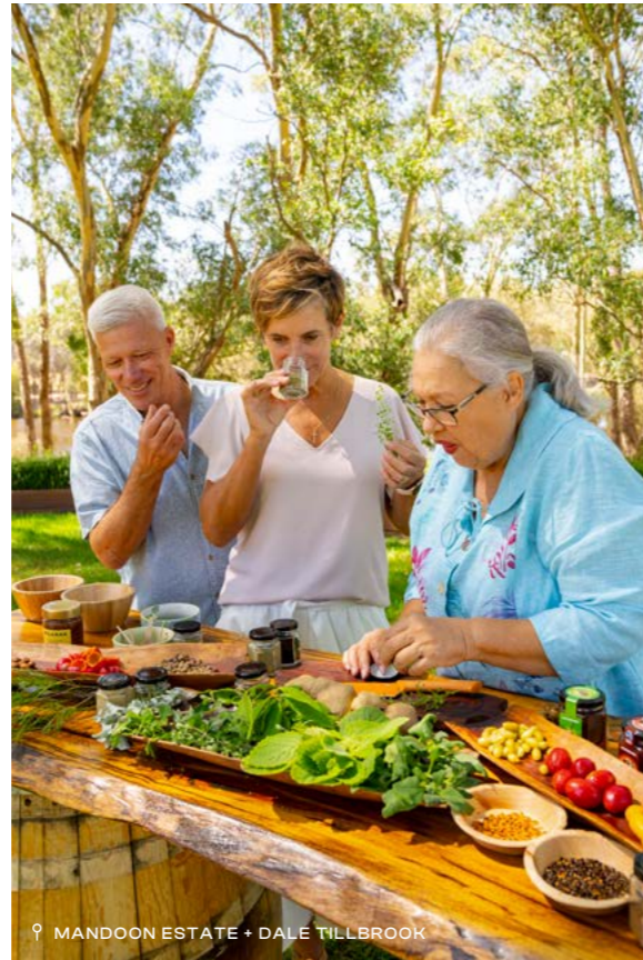
♀ MANDOON ESTATE + DALE TILLBROOK