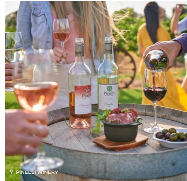
♀ PINELLI WINERY

Head to one of the local pubs in the evening for live music or local entertainment. Ask the visitor centre what's on this week.