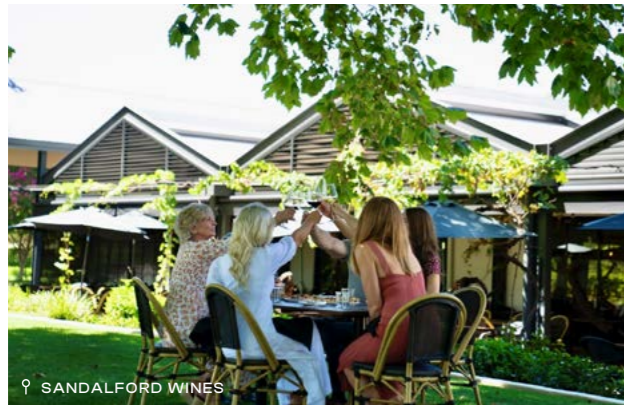
♀ SANDALFORD WINES

Unwind with a long, relaxed dinner overlooking vineyards as the sun sets.