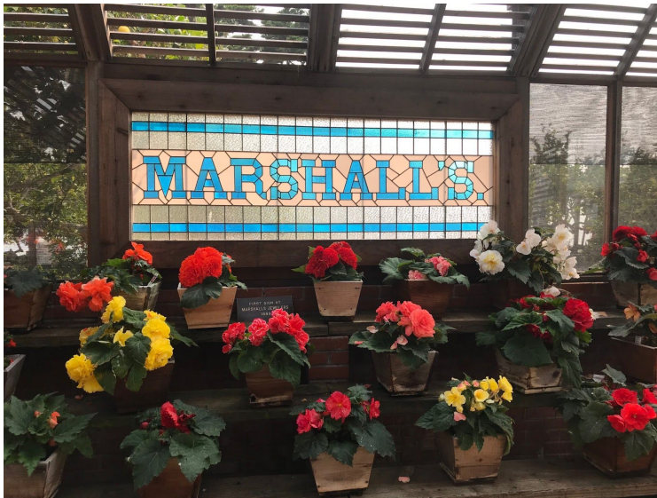
The Begonia House