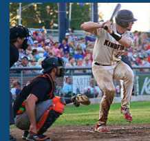
Northwoods Baseball League