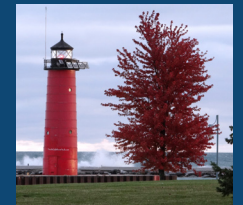
Lake Michigan Adventures